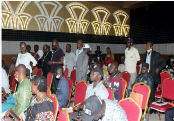
CROSS SECTION OF NEC MEMBERS