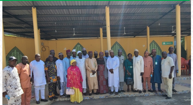
CROSS SECTION OF NAC MEMBERS AT THE VENUE OF CONGRESS