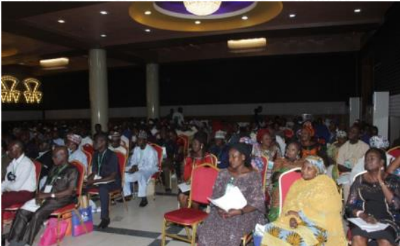
CROSS SECTION OF NEC MEMBERS ATTENDING THE 39TH NEC MEETING IN ABUJA.