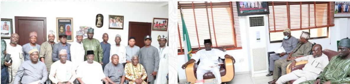
THE PRESIDENT OF THE NIGERIA LABOUR CONGRESS (NLC), COMRADE AYUBA WABBA IN A GROUP PHOTOGRAPH WITH SSANU NAC MEMBERS.