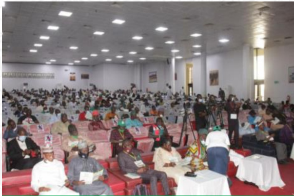
CROSS SECTION OF DELEGATES AT THE 2ND QUADRENNIAL DELEGATES CONFERENCE