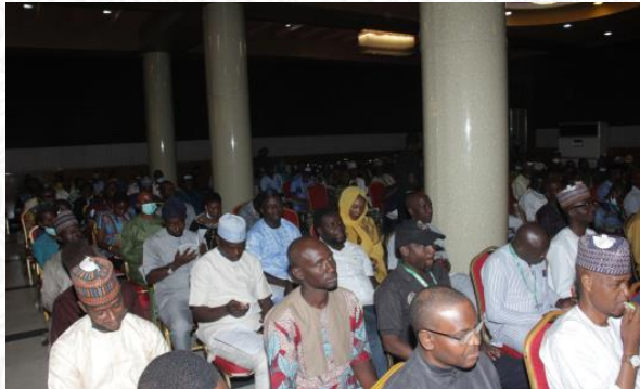
CROSS SECTION OF NEC MEMBERS ATTENDING THE 39TH NEC MEETING IN ABUJA.