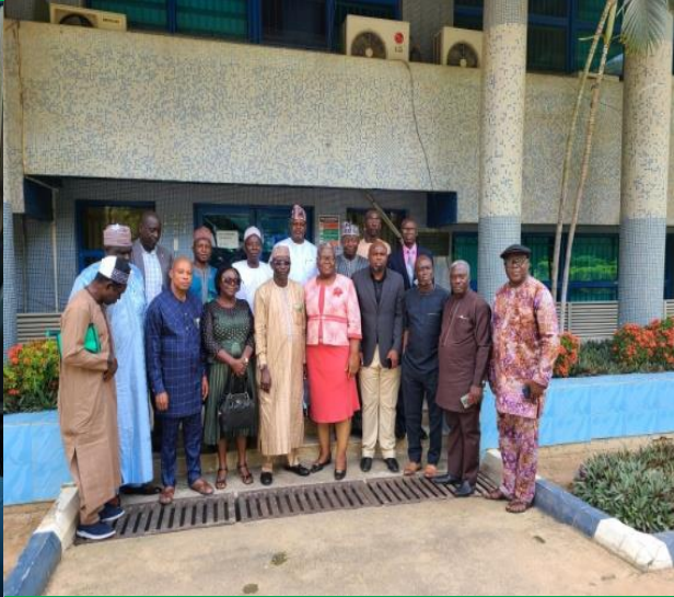
A GROUP PHOTOGRAPH OF NAC MEMBERS & MANAGEMENT OF DIGITAL BRIDGE INSTITUTE, ABUJA.