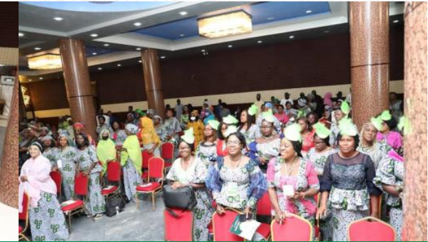
CROSS SECTION OF SENIOR STAFF ASSOCIATION OF NIGERIAN UNIVERSITIES (SSANU) WOMEN, AT THE 2021 NATIONAL WOMEN CONFERENCE