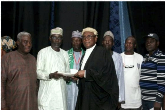
PRESIDENT RECEIVING HIS CERTIFICATE