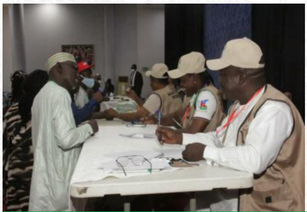
THE NEW PRESIDENT SIGNING HIS CERTIFICATE