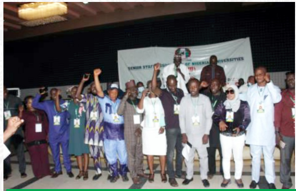
NEWLY ELECTED BRANCH CHAIRMEN AT THE PODIUM