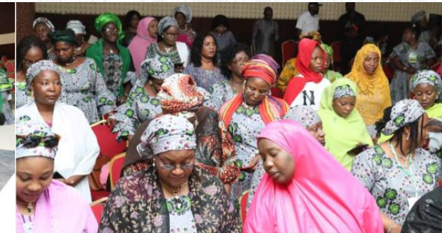
CROSS SECTION OF SENIOR STAFF ASSOCIATION OF NIGERIAN UNIVERSITIES (SSANU) WOMEN, AT THE 2021 NATIONAL WOMEN CONFERENCE