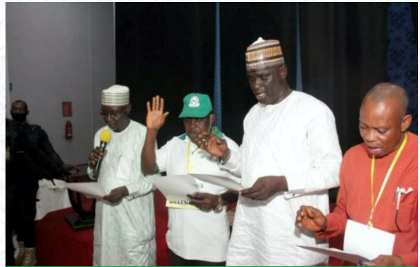
PRESIDENT & NEWLY ELECTED NAC MEMBERS TAKING OATH OF OFFICE