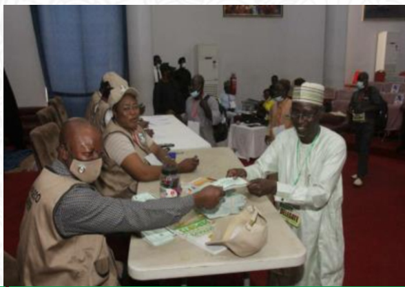
THE NEW PRESIDENT RECEIVING HIS CERTIFICATE