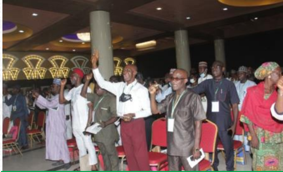
CROSS SECTION OF NEC MEMBERS IN SOLIDARITY SONG