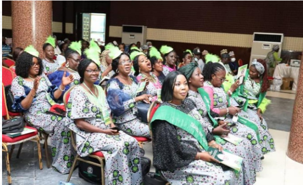
CROSS SECTION OF SENIOR STAFF ASSOCIATION OF NIGERIAN UNIVERSITIES (SSANU) WOMEN, AT THE 2021 NATIONAL WOMEN CONFERENCE